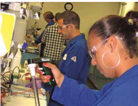
Researchers at BioAmber's facility in Plymouth are looking for ways to use renewable agricultural feedstock to produce their chemical products.

Lantinen will add candy-colored, shredded recycled paper "grass" to next spring's offerings. She sees a myriad of opportunities to introduce local, low-waste items for holiday celebrations. Her resourcefulness just may help trim back some of that post-holiday trash.