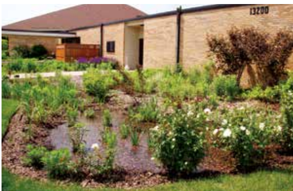
A well-maintained rain garden at Vision of Glory Lutheran Church captures and cleans storm water runoff.

Their stewardship goes beyond the walls of the building. Students and teachers from the church's Children's Learning Center compost organics to enhance their community gardens. A rain garden is maintained to filter and infiltrate runoff from the parking lot.