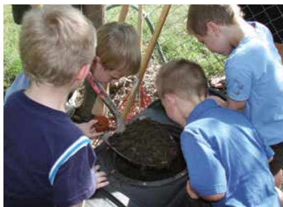
Pre-school classes learn about reducing waste and composting at the Children's Learning Center at Mount Olivet Lutheran Church.

The change has yielded annual energy savings of nearly 700,000 kilowatt hours, cost savings of more than $48,000 and a reduction of 348 tons in carbon dioxide.