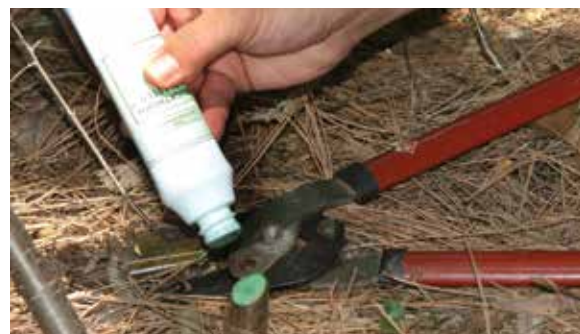
Apply an herbicide to the buckthorn stump within two hours of cutting to prevent re-sprouting. A dye mixed into the herbicide will help you make sure that the entire surface is treated.

Go to plymouthmn.gov/greenup for links to detailed information on controlling buckthorn and suggestions for replacement plants. Dave Turbenson (see Environmental Champions on page 2E) has also put together a very informative website, removebadplants.com .