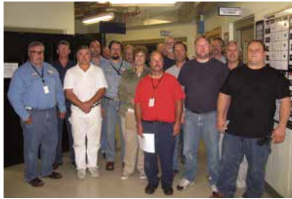
Members of Honeywell's Facility Services staff are directly involved in implementing the company's environmental projects.

Researchers at the Plymouth facility are exploring new ways to use alternative agricultural feedstock in their process. The company's work to build an economically sustainable model for environmentally preferable products has earned it a number of environmental awards, including the 2011 US Environmental Protection Agency Presidential Green Chemistry Challenge Award.