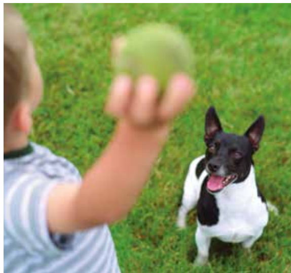
Games, pets and foot traffic all affect the maintenance needs of grass for a healthy lawn.

You don't have to guess about your lawn's fertilization needs. Send in a soil sample to receive helpful recommendations from the University of Minnesota