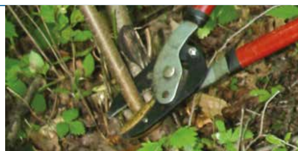
Choose a pruner or lopper sized to cut the trunk of the buckthorn plant near the ground. A saw may be required for larger plants.

Large Plants. Buckthorn plants that are two inches in diameter or larger, are best controlled by cutting the stem at the soil surface and then covering or treating the stump to prevent re-sprouting.