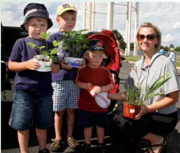
Plymouth's Plant Swap offers a fun, free opportunity to diversify your landscape with plant swap finds.

Questions? Call Forester Paul Buck at 763-509-5944.