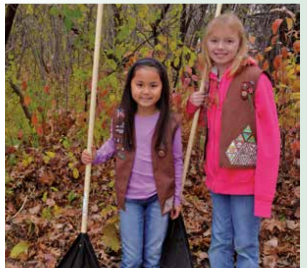
Girl Scouts will celebrate 100 years of scouting with a region-wide cleanup for clean water effort.

Everyone is encouraged to join the Girl Scout effort to protect our lakes. And everyone is invited to report their efforts on the Freshwater Society's database. So, join the Girl Scouts on Oct. 13 by cleaning up leaves, litter and other debris. Count the number of bags you fill, then go to freshwater.org/report to ensure your efforts are counted.